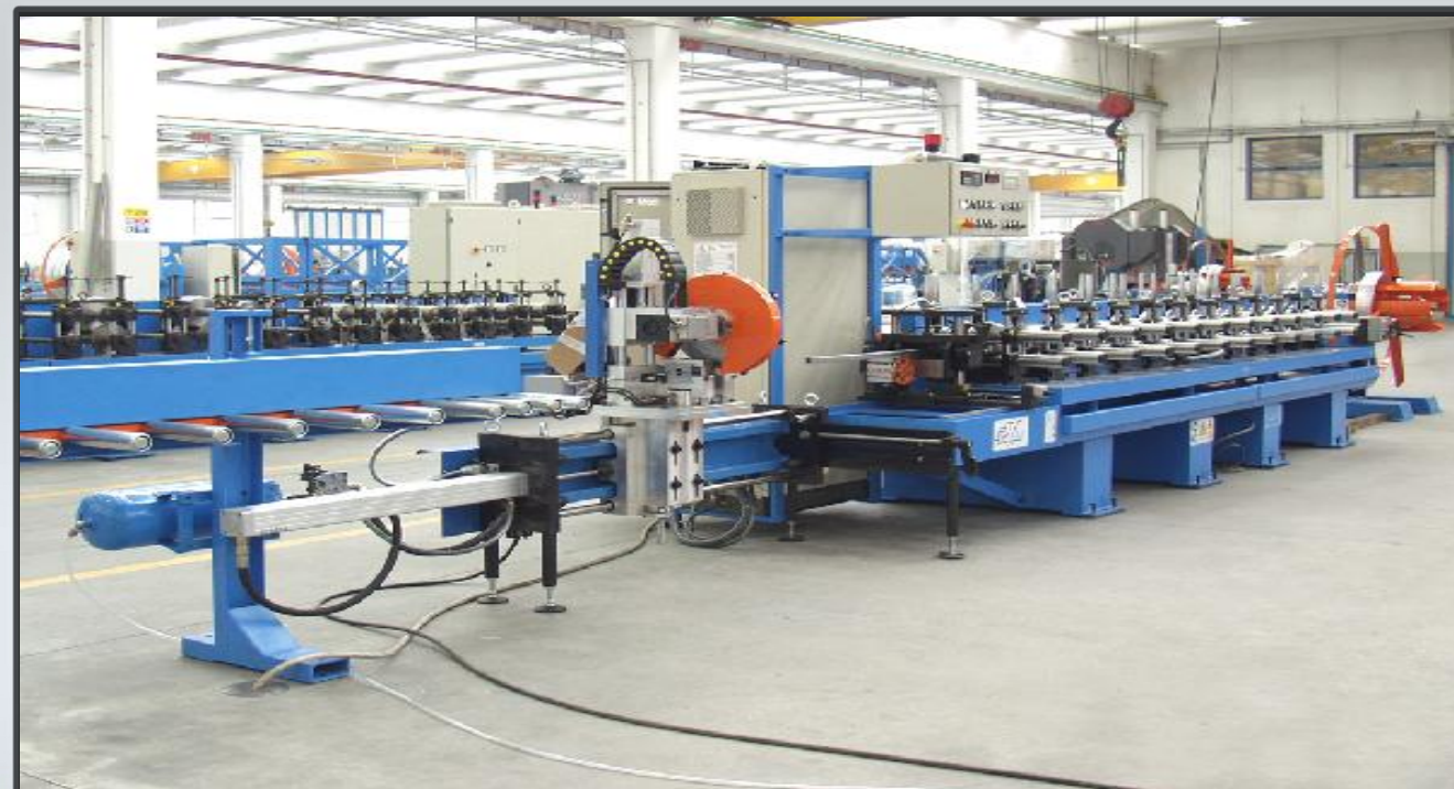
View of the machine