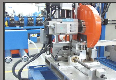
Fix cutting saw