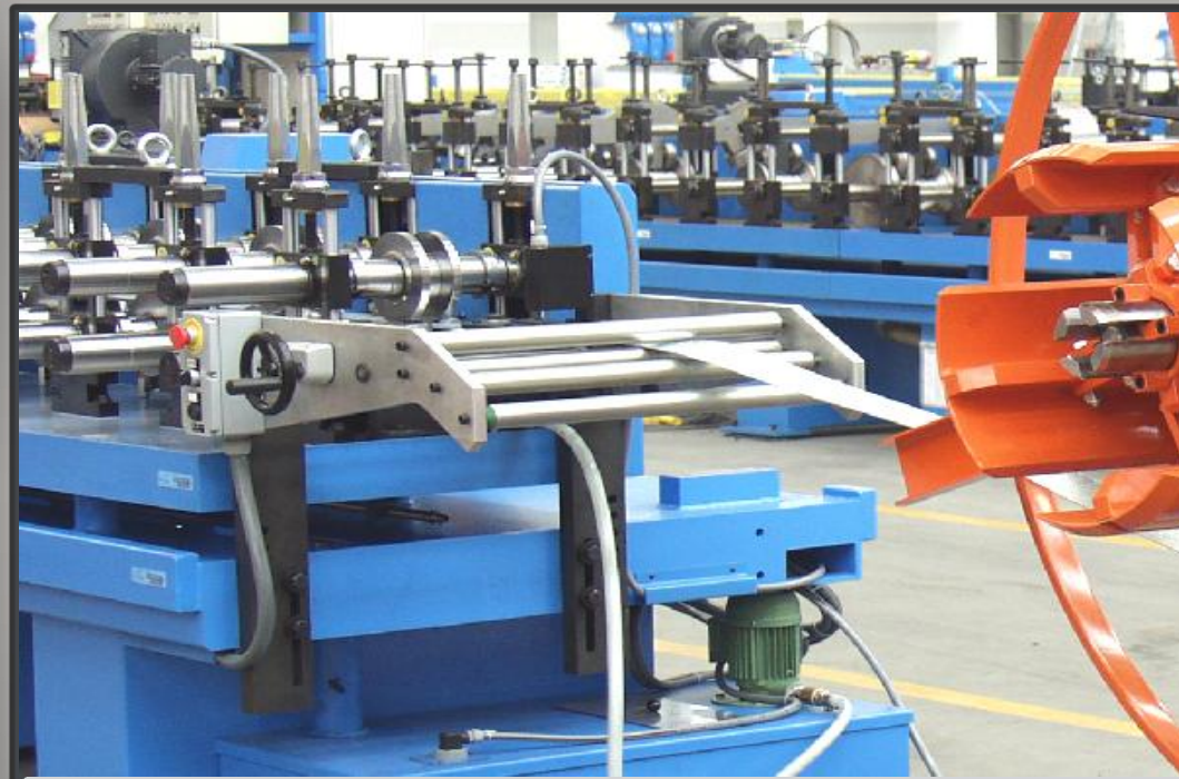
Detail of strip introduction zone

Automatic line for the production of reinforcement profiles for plastic doors or windows. Possibility to insert combinable toolings (rolls) to be able to produce profiles with different widths and heights, besides it is possible to couple other series of rolls (different forms). The roll forming line has also the possibility for rapid change (with cassettes) to make various types of products. As option it is possible to have double decoiler, flying shear, unloader / stacker.