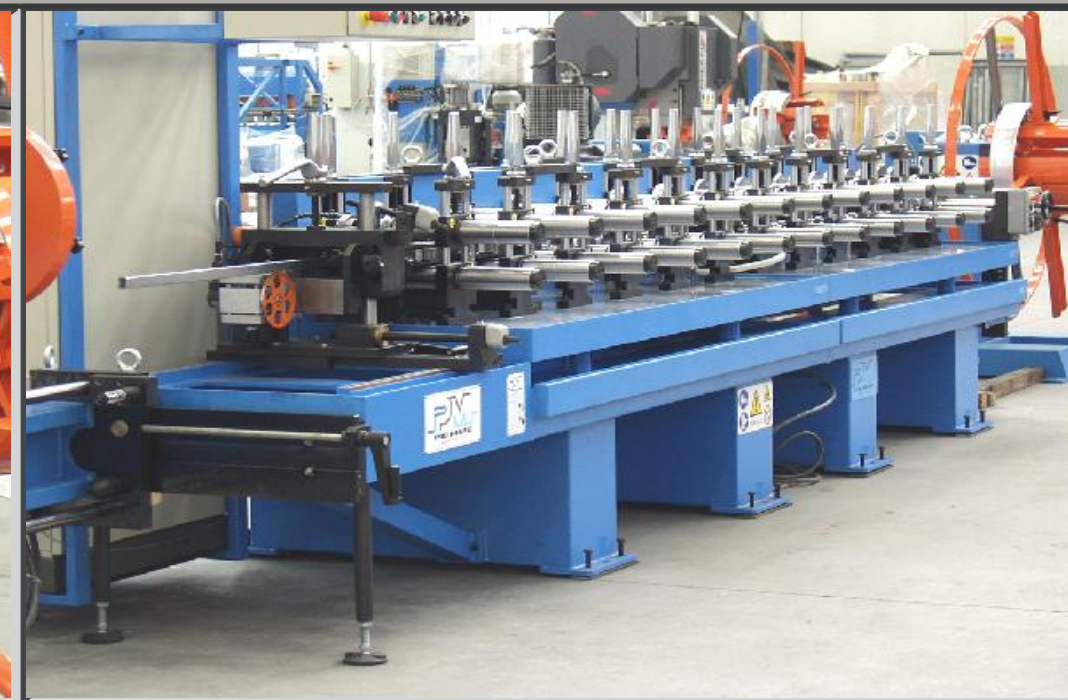
Roll forming line