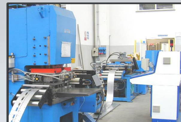
Decoiler, heading and welding bench, press