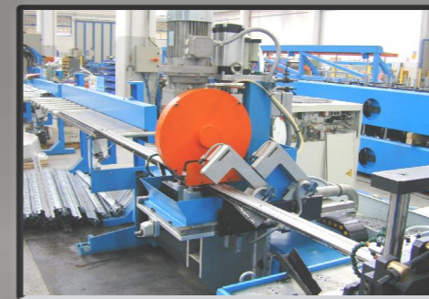
Flying saw and unloading bench