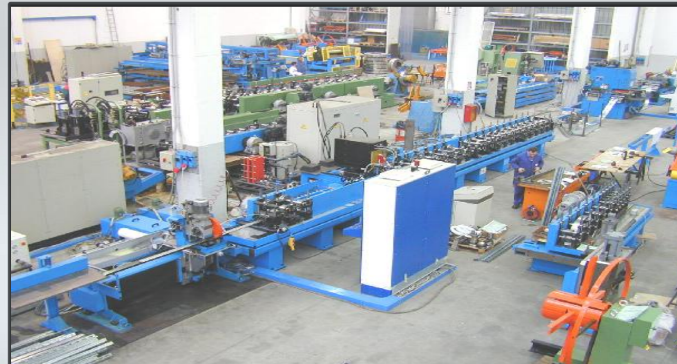
General view of the machine