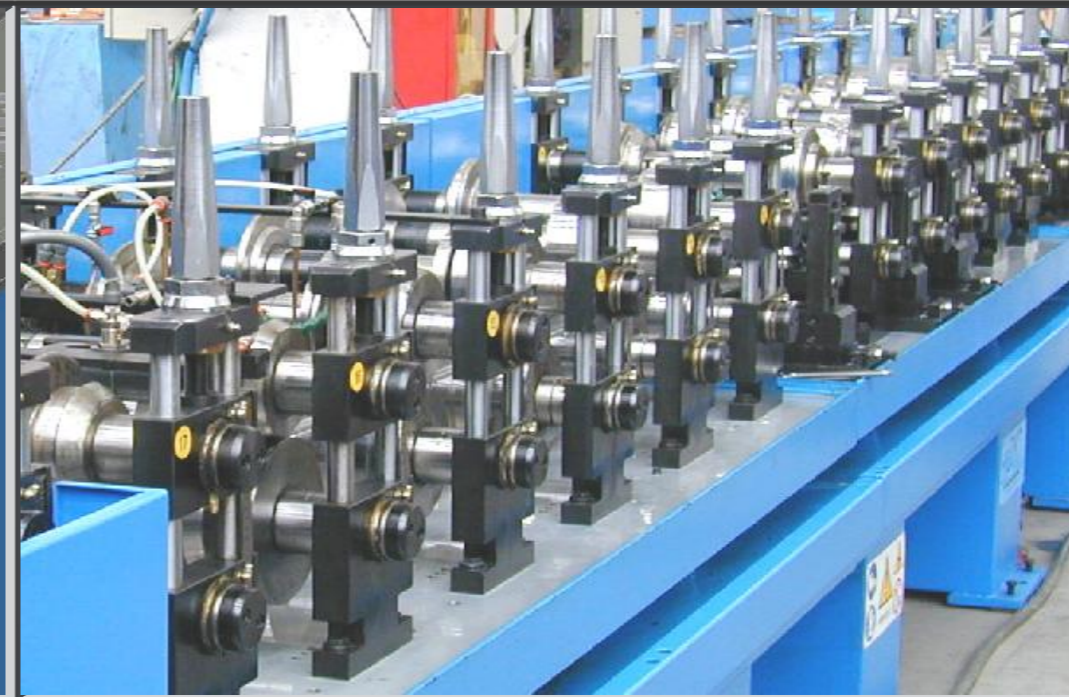
Detail of roll forming line